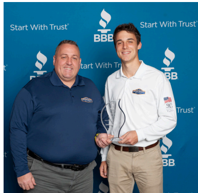
Upstate Granite Solutions Marketplace Ethics 11-49 Employees