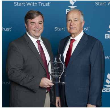
Stokes & Company, CPA's, PC Customer Service 11-49 Employees