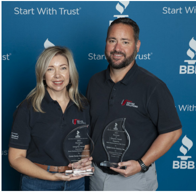
Upstate Service Solutions Customer Service & Marketplace Ethics 1-10 Employees