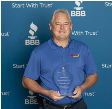
Complete Heat & Air, LLC Community Service 11-49 Employees