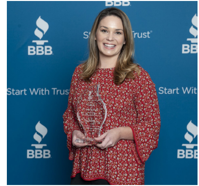
Guy Roofing, Inc. Customer Service 50-199 Employees